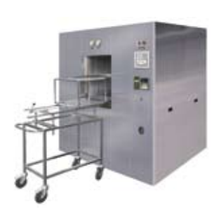
Large sterilizers for various industries and market needs

Featuring Tuttnauer's range of cleaning, disinfection and sterilization solutions