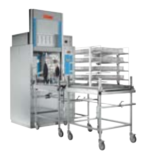
Washers/disinfectors for hospitals and laboratories