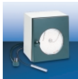
Optional Temperature Recorder (free-standing).

Optional inventory components, including racks and boxes, may be ordered separately.